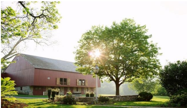
restored barn to be focal point for 2015 gala

The Farm at Eagles Ridge at 465 Long Lane, a few miles from downtown Lancaster, has been chosen as the host site for the 2015 Gourmet Gala on Sunday, May 17, from 4 p.m. to 7 p.m.