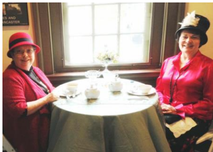
Downton Abbey teas were enjoyed at the Preservation Trust on March 14 & 15