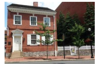
Historic Preservation Trust headquarters at 123 North Prince Street in downtown Lancaster