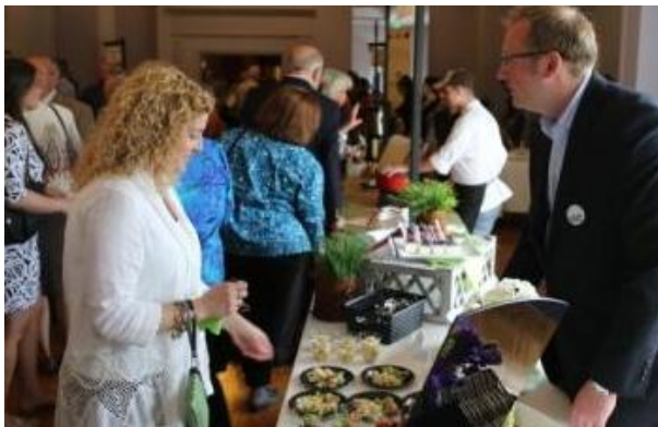
tickets sold out early for the 2014 gala