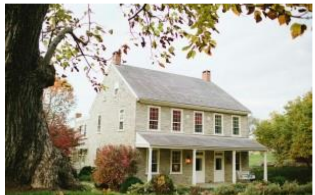
stone farmhouse at The Farm at Eagles Ridge