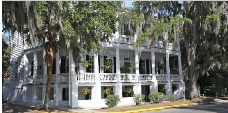
Charleston, South Carolina

ON SEPTEMBER SOUTHERN TOUR OF HISTORIC CITIES – Charleston and Beaufort in South Carolina; Savannah, Jekyll Island and St. Simons Island in Georgia; and Jacksonville and St. Augustine in Florida.