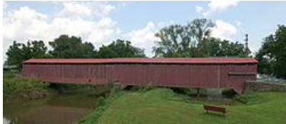
threatened -- Herr's Mill Bridge

Three properties from the 2012 list of most threatened historic properties in