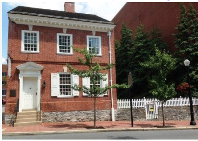
Tour Stop #1 - Historic Preservation Trust Headquarters at 123 North Prince Street

Tickets for the tour are $18 for members of the Historic Preservation Trust, $20 for non-members and $10 for children under the age of 12. Blocks of five tickets may be purchased for $75. Additional information is available at www.hptrust.org .