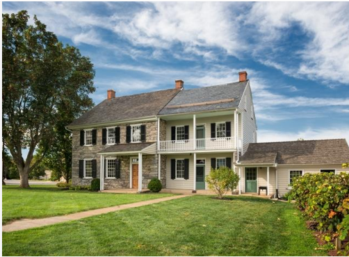
Mylin House (1787)