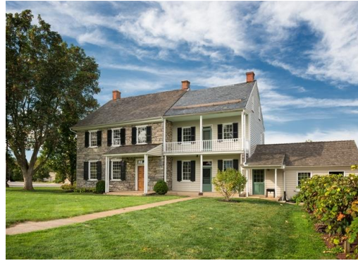
Mylin House (1787)

The 2014 Gourmet Gala, the annual fundraiser for the Historic Preservation Trust of Lancaster County, will be held on Sunday, May 18, from 4 pm to 7 pm at the historic Mylin House (1787) and The Cultural Center at Willow Valley Communities in Willow Street.