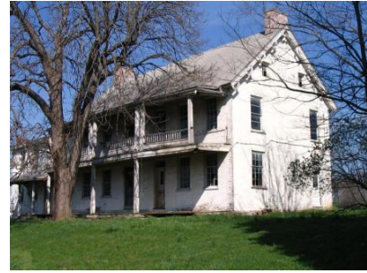
James Anderson II House