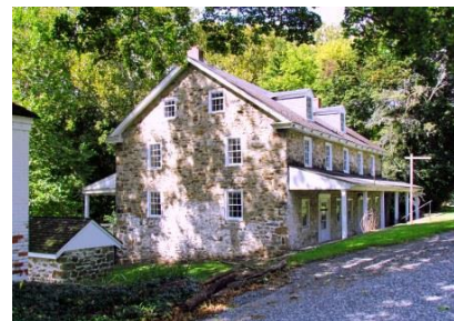
Circle Creek Farmhouse/ Guy's Distillery