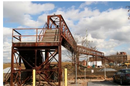
Armstrong Pedestrian Bridge

Tens of thousands of Lancastrians have used this 280-foot-long, steel bridge to cross the Dillerville Road Rail Yard, most recently owned by Norfolk Southern. These rail lines have recently been removed. For some 70 years, this footbridge made access for Armstrong employees easier and safer to their work. It has continued to be used by Franklin & Marshall students walking or running to athletic fields and by area residents accessing nearby neighborhoods. Current plans are to dismantle and relocate this iconic bridge