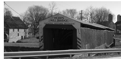
Herr's Mill Bridge

The only double-span covered bridge in Lancaster County crosses the Pequea Creek and the adjacent mill race. It was listed on the National Register of Historic Places in 1980. Concerned citizens and organizations are working with the Lancaster County Commissioners to save this threatened structure.