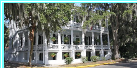
Charleston, South Carolina